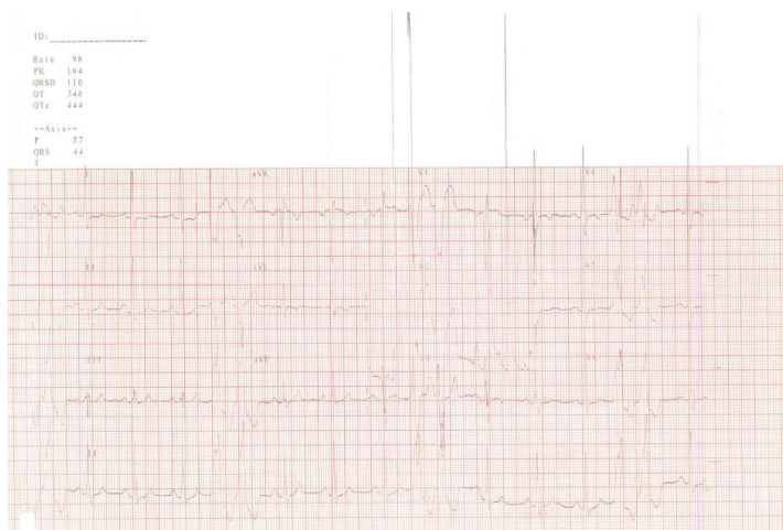
Figure 1: Stress ECG with non-sustained Ventricular tachycardia